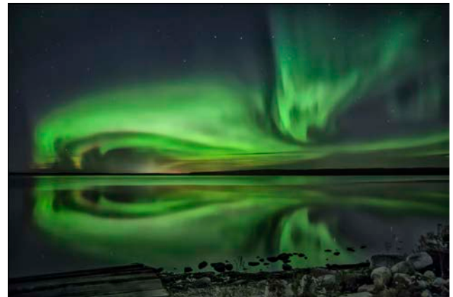
Aurora over the lake